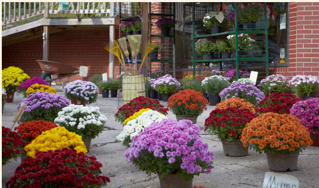
Schneider's Hardware in bloom.