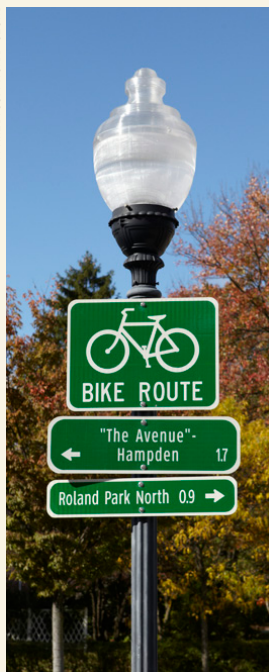
Roland Avenue becomes a car-free zone this Sunday for Ciclovía IV!